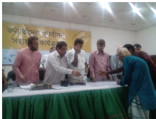
SETU's initiatives in disaster management