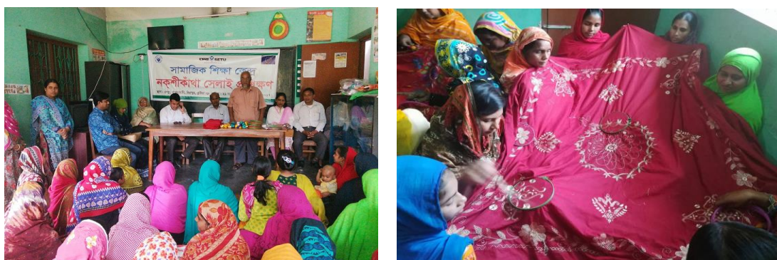
CLC women during nakshi katha training

A facilitator conducts classes in the CLC under guidance of a supervisor. Moreover 40 nos. of women of the community completed Nakshi Katha training of 22 days duration.