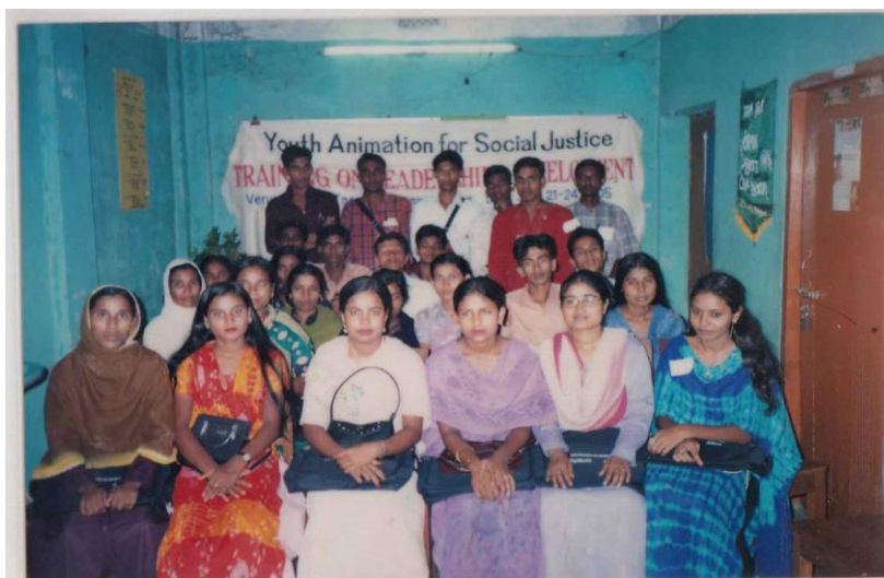
Participation of male- female youth in a session

SETU implements youth animation for social justice project in order to mobilize and empower the youth towards establishing rights, governance & justice. The project covers Kushtia Municipal area & 4 unions of Daulatpur Upazila under Kushtia district. Under the project 50 nos. of Youth Alliance (Jubo Morcha) were formed among those, (Kushtia Municipality-04 & Daulatpur Upazila-36) Upazila level-1 and Municipal level-1, with 21 youth in each alliance. This program includes awareness campaign, formation of youth watchdog groups, youth parliament, youth congress, organize job fair, cross learning visit, capacity building etc. with a view to harnessing the youth potentials for their issues. About 5,000 youth are actively involved in this process.