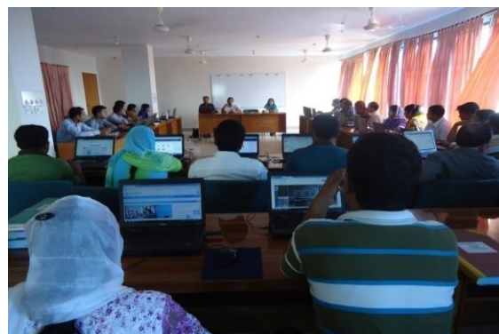
Participants in a training course on ICT

SETU provides management training and technical assistance to its staff members with a view to enabling them in utilizing Information Communication Technology in their respective fields. These initiatives empower them to cope with the modern challenges in performing daily duties. In this regard SETU organized series of courses/tasks on automation, networking, MIS, data analysis using its computer facilities. Already all offices of SETU were connected with online network, facilitating quick dissemination of information on a regular basis. Obviously this technological empowerment of staff through ICT results in speedy and fruitful performance of organizational work.