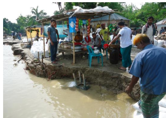
Flood victims lose resources, lead sub human life in almost every year