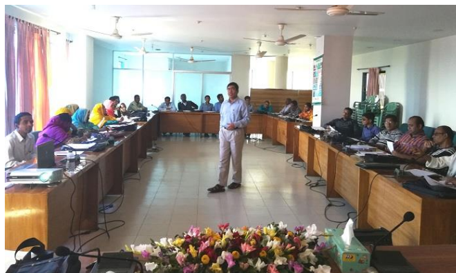
A course on democracy education

Empowering the people towards involvement in democratic process is essential. Democracy education for active citizen is indeed an urgent task of the day. With this view SETU undertakes democracy education program with participation of national and international organizations. This program includes: training, observation, mobilization, monitoring, media campaign etc. Mentionable that SETU is associated with National Democratic Institute (NDI) in carrying out democracy education.