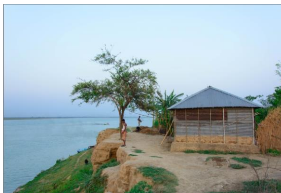
River erosion is a yearly phenomenon and causes sufferings to villagers