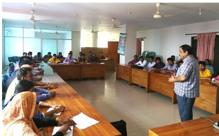
Awareness meeting on tax justice

SETU raises awareness among communities on tax justice enabling them to claim their socio-economic development as they pay taxes in everyday life. This activity includes: meeting, seminar, FGDs, interaction with groups & CSOs etc. for mass mobilization. The organization promotes peoples participation on this issues, particularly the underprivileged groups.