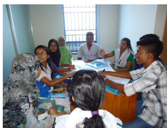
Participation of learners in different educational activities