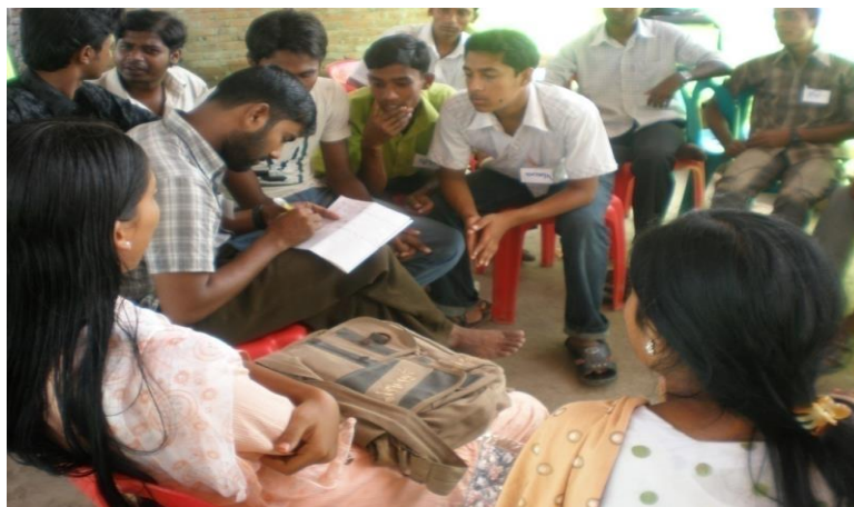
PWDs in a group work

SETU implemented the above mentioned project in Kushtia Sadar and Khoksa upazila under Kushtia district. SETU assists the PWDs in involving them in socio-economic activities enabling them to voice their rights and opportunities. Initial activities of the project are institution building, savings mobilization and awareness raising about human rights, health etc., providing health support, aids/appliances support and capacity building.