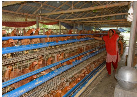
The photos show two economic schemes of SETU's group member.