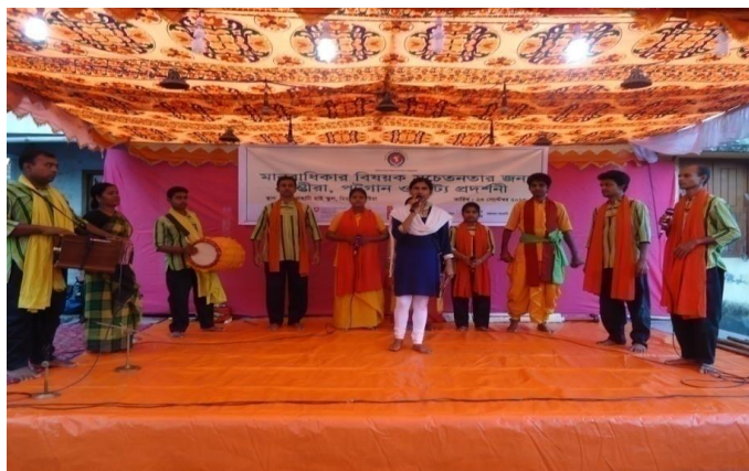
Participants in a cultural function

SETU initiates cultural program in order to promote human action against inhuman and illegal activities, violence, domination, fundamentalism etc. Under this program, SETU organizes cultural activities in rural areas, patronize cultural organizations and activists, builds capacities of cultural groups and workers through training and disseminate information on development issues through cultural media.